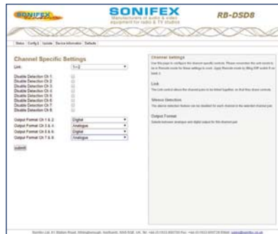
Channel Specific Settings Webpage.