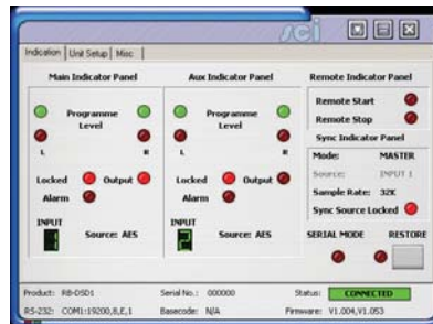
SCI Indicator Page.

The RB-DSD1 has been designed to have a passive signal path through the main input, so if power to the unit fails, signal input 1 is routed to output 1 and signal input 2 is routed to output 2. This is essential for applications such as installation at transmitter sites, where a power failure to the unit should not prevent the audio input signal from being output to the transmitter.