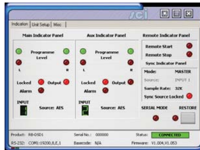
SCI Indicator Page.

The RB-DSD1 has been designed to have a passive signal path through the main input, so if power to the unit fails, signal input 1 is routed to output 1 and signal input 2 is routed to output 2. This is essential for applications such as installation at transmitter sites, where a power failure to the unit should not prevent the audio input signal from being output to the transmitter.