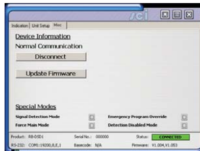
SCI Miscellaneous Page.