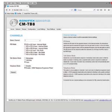
CM-TB8G GSM Enable Page.

IFB modes are fully supported on the telephone channels allowing selected input signals to be routed to a connected telephone call.