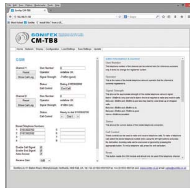
CM-TB8G GSM Configuration Page.

Telephone calls are made and received using the embedded web server or directly using the channel controls. The CM-TB8 can store 8 telephone numbers and each channel can speed dial the required number.