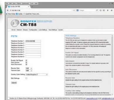
CM-TB8T PSTN Configuration Page.