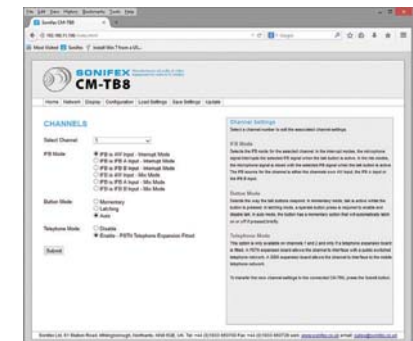
CM-TB8T Channels Config Page.