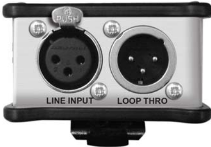
Fig 3-2: Bottom Panel View of CM-BHA

The audio connections are found on the bottom panel, and both have the following connections: