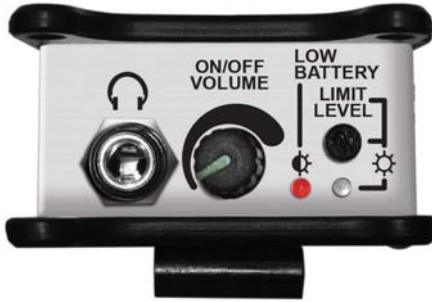
Fig 2-1: Top Panel View of CM-BHA