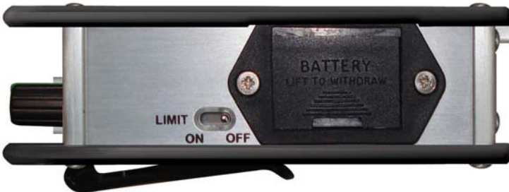
Fig 3-1: Side Panel View of CM-BHA