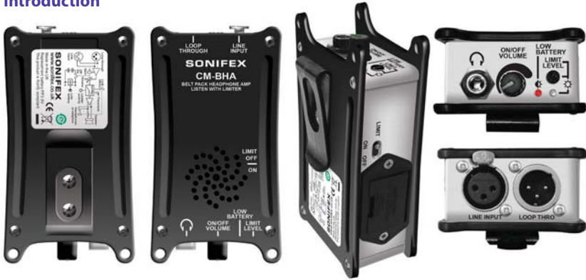
Fig 1-1: CM-BHA Belt Pack Headphone Amplifier

The CM-BHA is a portable, battery powered headphone amplifier for use in live applications such as in-the-field news reports, providing audio feed monitoring by headphones, earpiece, or built-in speaker.