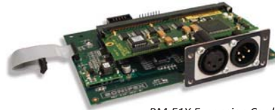
RM-E1X Expansion Card.

Features: Dolby metadata display on connected PC, 8 input metering on 4 meters, Dolby E decoding & monitoring.