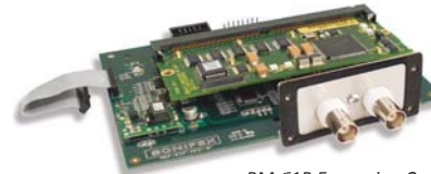
RM-E1B Expansion Card.

These expansion boards for the Reference Monitor RM-4C8 allow the monitoring of a digital audio stream containing either Linear PCM or Dolby* encoded audio.