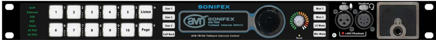
AVN-TB10AR Front View.