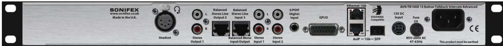
AVN-TB10AR Rear View.